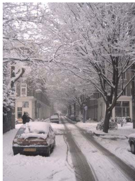
It's cold in Amsterdam but we are not hibernating!